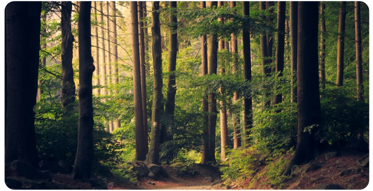
Biogradska gora primeval forest