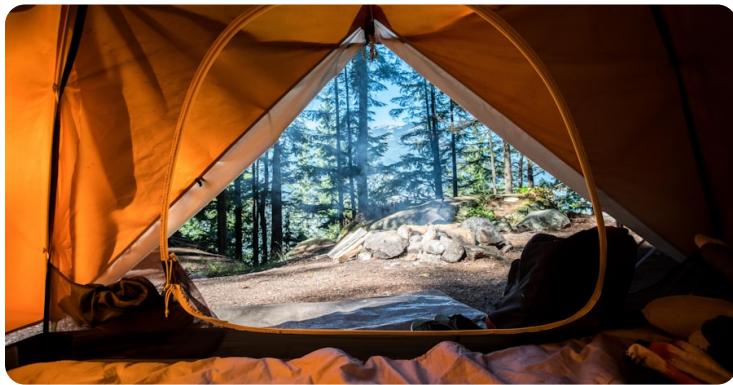
Evenings by the river